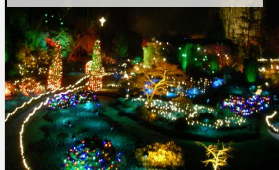
Photo A: Butchart Gardens Christmas Lights. Charity: Mustard Seed Food Bank

The winner of our last newsletter photo contest was Photo E, (the puppy sitting in the screen), and the winning charity, the SPCA.